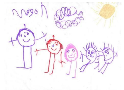
writing la escritura