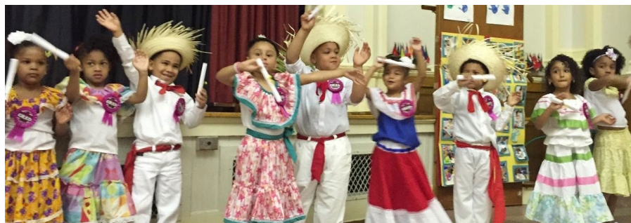
learning together . . . aprendiendo juntos