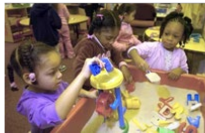
science las ciencias