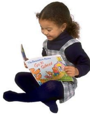
reading la lectura