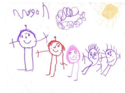
writing la escritura