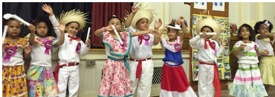
learning together . . . aprendiendo juntos