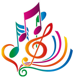
music la música