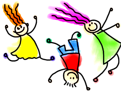
movement el movimiento