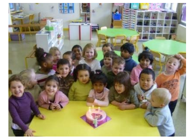
friends las amistades