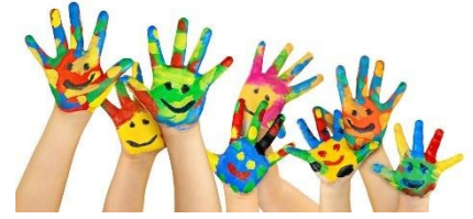
creativity la creatividad